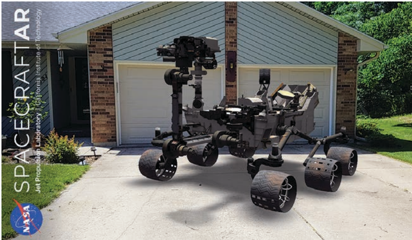
FIGURE 1: Augmented reality of Mars Curiosity rover